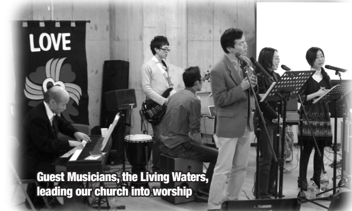
Guest Musicians, the Living Waters, leading our church into worship