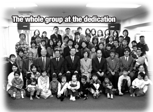
The whole group at the dedication

It was a privilege to have attended Okachimachi Baptist Church's building dedication a few weeks back. This is the church that we interned at during our first two years in Japan. It took some 25 years, but the church now has its own piece of downtown Tokyo property. Given the cost of land in downtown Tokyo (way too many zeros involved), it truly is a work of God. The pastor ( center below ) reminded the people that God is still in the business of miracles.