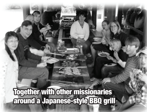
Together with other missionaries around a Japanese-style BBQ grill

Every once in a while we need to get apart from the work, and reflect on God's goodness and greatness in our life that empowers us in the work. Not having to be in charge, and getting a chance to hear a few messages in English is a great blessing!