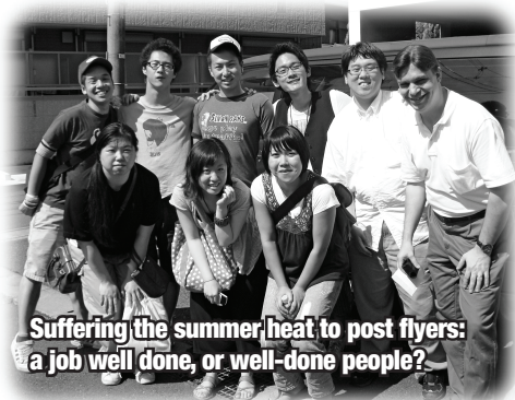
Suffering the summer heat to post flyers: a job well done, or well-done people?

We appreciated the effort of several Japanese Christian college students who braved the summer heat to pass out flyers for our Kids English Bee ( on front ).