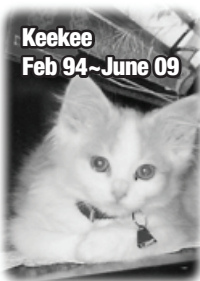
Keekee Feb 94~June 09

We knew the day was coming, but that didn't make the decision any easier. After 15 years of being a part of our family history, it came time to let her go. Her recent grand mal seizures became as painful for her to let us see as they were for us to watch.