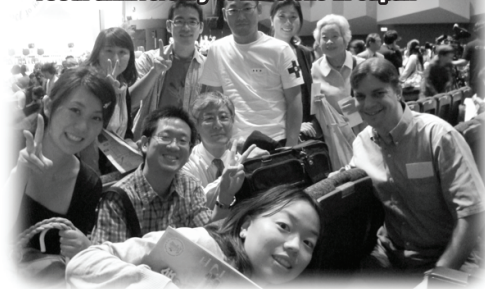
Our Denen Grace Chapel group at the 150th anniversary of missions in Japan