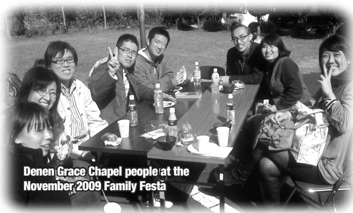
Denen Grace Chapel people at the November 2009 Family Festa

JAPAN ADDRESS: 4-14-24-1 Futago, Takatsu; Kawasaki 213-0002 EMAIL: lavernansinJapan@mac.com