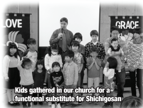
Kids gathered in our church for a functional substitute for Shichigosan

Japanese celebrate a 1000-year-old festival in November called Shichigosan. "Shichigosan" literally means "seven, five, three." These are the ages that are considered critical in a child's development