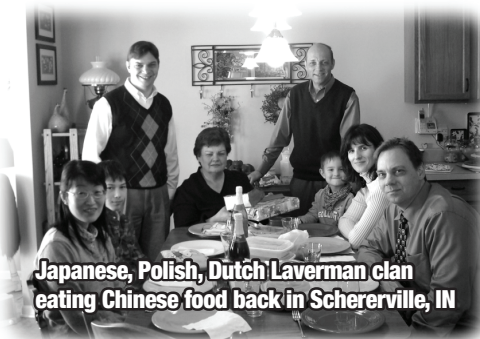
Japanese, Polish, Dutch Laverman clan eating Chinese food back in Schererville, IN

We scooted into Chicago on Monday just ahead of the big snowfall on Tuesday. Okay,