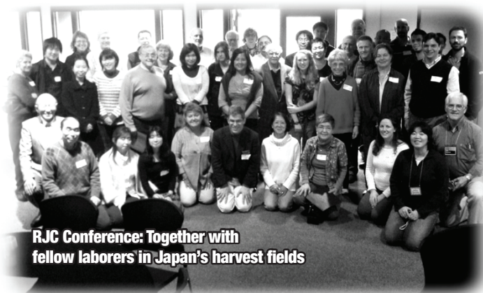
RJC Conference: Together with fellow laborers in Japan's harvest fields