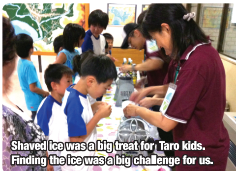
Shaved ice was a big treat for Taro kids. Finding the ice was a big challenge for us.

(from front) and neighbors were washed away. They only survived because their homes were built slightly higher up.