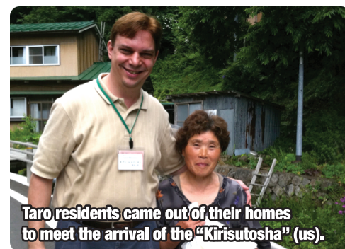
Taro residents came out of their homes to meet the arrival of the "Kirisutosha" (us).

backpacks specially made to Japan school specs and quite expensive to replace. We spread the word through church members and PTAs for lightly-used backpacks. The response was overwhelming. We delivered two vanloads stuffed from floor to roof.