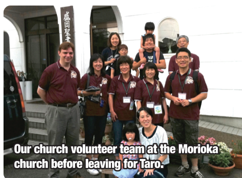
Our church volunteer team at the Morioka church before leaving for Taro.

The suicide rate there has escalated dramatically post 311. So our focus was heart care: talking with residents, delivering food items, offering to pray, doing light cleaning, asking about their needs, and