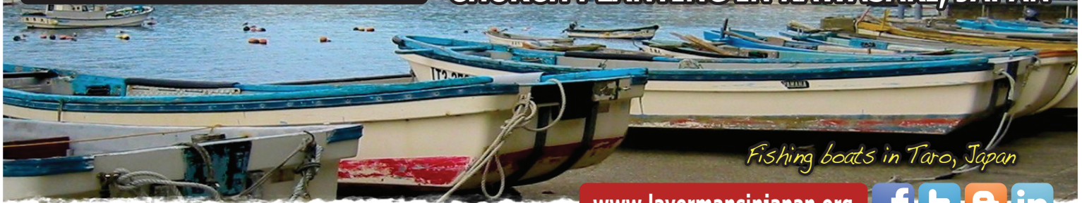
Fishing boats in Taro, Japan