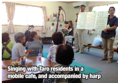
Singing with Taro residents in a mobile cafe, and accompanied by harp

When we arrived, residents were still reeling over recent news from local officials that they should expect to stay put at least another five years. The return "home" for them is very uncertain. We volunteers did our best to provide comfort and encouragement by organizing "mobile cafés." We'd set up a light meal and coffee or tea in a common room, then go door-to-door to chat and invite residents to come. We provided listening ears for their many sorrows, and sometimes a sing-along, craft, or game.