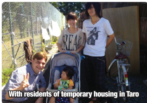
With residents of temporary housing in Taro

"We don't need nets to catch the "fish" anymore. The fish have come up on the land to us!" (Japanese pastor on the response in northern Japan)