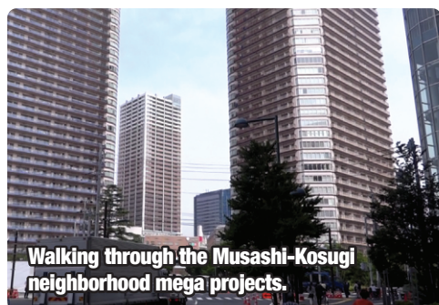
Walking through the Musashi-Kosugi neighborhood mega projects.

I've been doing a lot of walking. Losing pounds, focusing on prayer, and looking at potential new church sites.