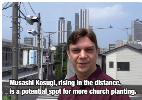
Musashi Kosugi, rising in the distance, is a potential spot for more church planting.

But walking about gave me an even greater reason to consider this spot: