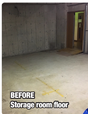
BEFORE Storage room floor