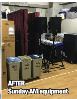
AFTER Sunday AM equipment

Not everything moves at the speed of a hamburger patty in Japan. When it comes to the church, things seems to take a long time. It takes years just to get conversant in the language. It takes many years to see people won to Christ and a small congregation built up. So if you want to church plant in Japan, you better have the patience of Job and lifespan of Methuselah.