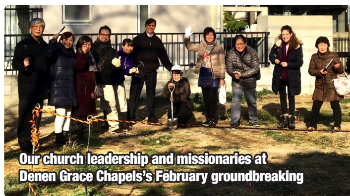
Our church leadership and missionaries at Denen Grace Chapels's February groundbreaking